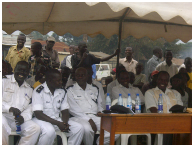
RSI works together with the Uganda Traffic Police