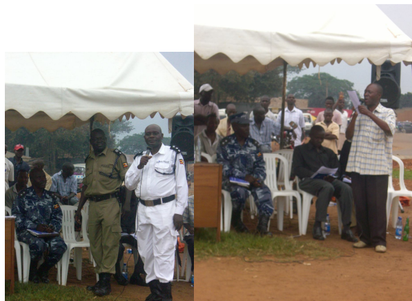
A member of RSI educating motorcyclists on road safety