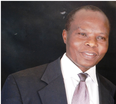
Chief Executive Officer

The Chairman is responsible for overseeing the work of the organisation. He is a retired senior police officer highly experienced in safety and security matters.