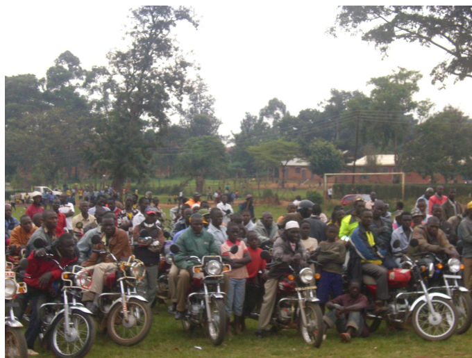
Boda-bodas (motorcyclists) at RSI seminar in Gayaza