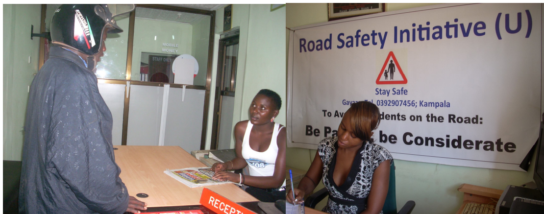
In conjunction with Rural Vision Cooperative Savings and Credit Society RSI facilities small loans to motorists

RSI works to create a strong, well capitalised and durable non-profit sector that connects money to the mission effectively, supporting the highest aspirations and most generous impulses of peoples and communities.